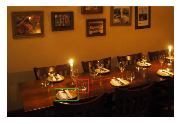
Figure 1: LOCATEDNEAR facts assist the detection of vague objects: if a set of knife, fork and plate is on the table, one may believe there is a glass beside based on the commonsense, even though these objects are hardly visible due to low light.

1. LOCATEDNEAR facts provide helpful prior knowledge to object detection tasks in com-